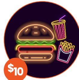
Fast-Food Combo Lunch